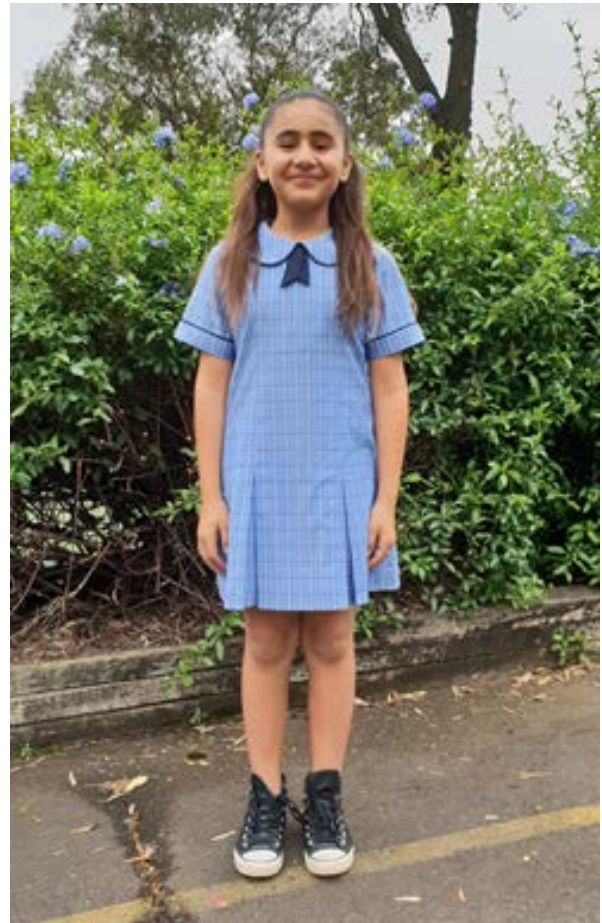
Our new school dress