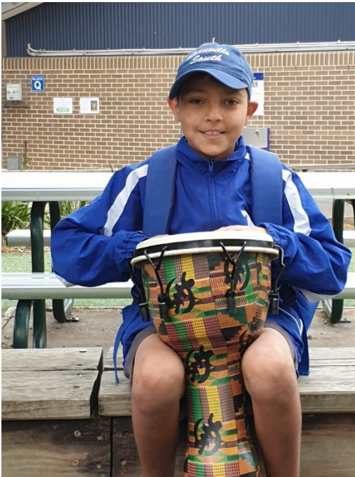
2/1AD STEM project